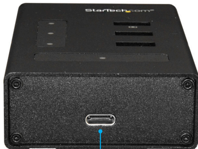
USB (Type-C) port (data only)